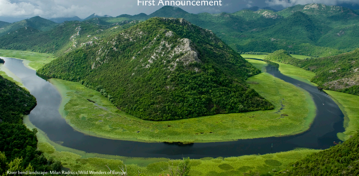
River bend landscape: Milan Radisics/Wild Wonders of Europe